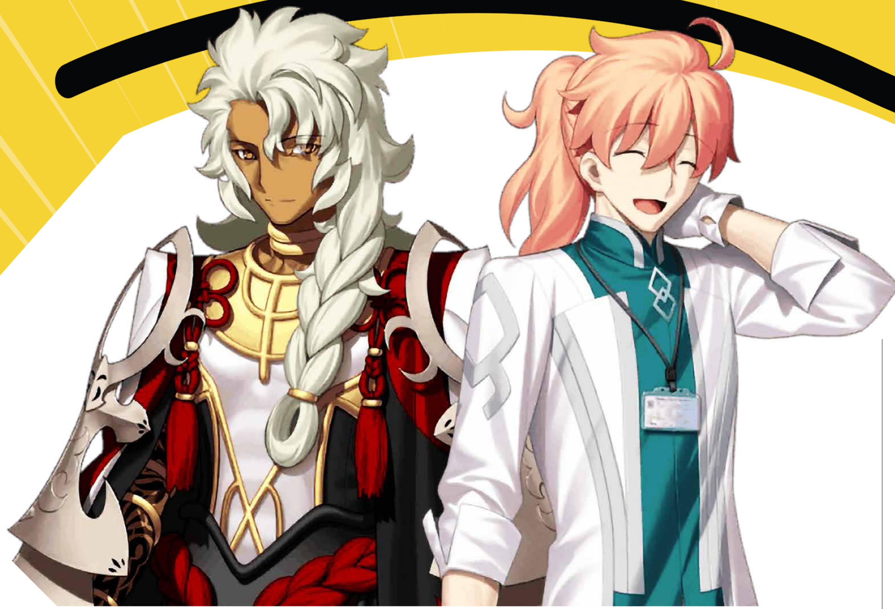
Images from Fate/Grand Order . At right is the bumbling doctor Romani, and at left is his Servant alter ego, Solomon.

A nother iteration of the aforementioned Fate franchise, Fate/Apocrypha is a series of novels-turned-anime that depict a different imagining of the Fate 's central Holy Grail War concept. In it are two teams of Servants - Black and Red - that compete for the grail. Joining the Caster class for the Black team is the great Jewish thinker and scholar, Solomon Ibn Gabirol. In-universe he's credited as the founder of Kabbalah, but his real power lies in his ability to create golems. He relies on a small army of golems that fight for him, and can create specialized golems for different tasks.