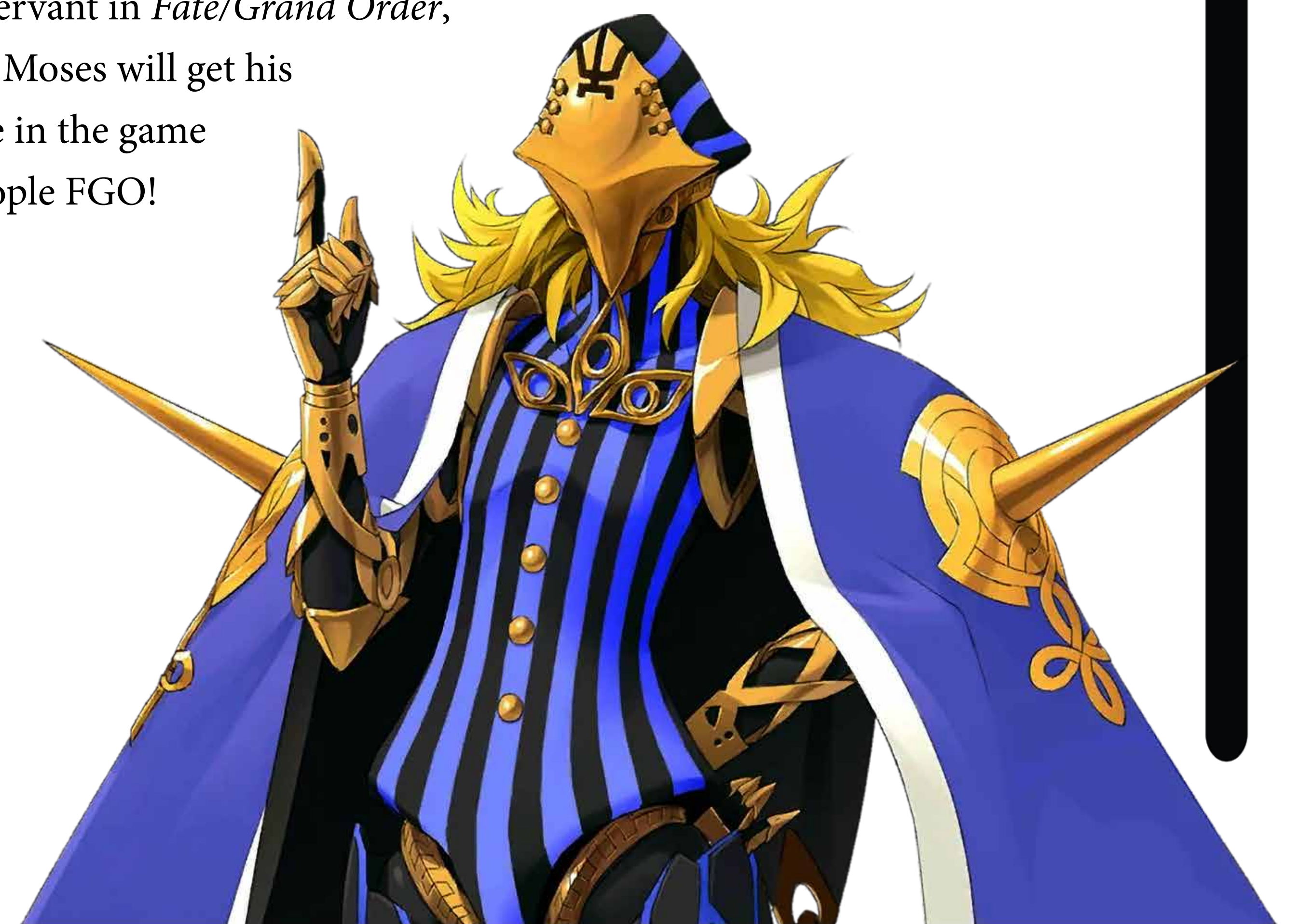
Avicbron character portrait from Fate/Grand Order

A quick side note before we move on from Fate, Moses also appears briefly in a Fate title (the Drama CDs Fate/Prototype: Fragments of a Blue Sky ) but since those are difficult to acquire legally, I don't have much exposure to Fate's iteration of Moses. As far as I can tell he's just a side character who comes up in relation to the Servant Ozymandias (Ramses II). Since Ozy is a summonable Servant in Fate/Grand Order , one day I hope Moses will get his chance to shine in the game too. Let my people FGO!